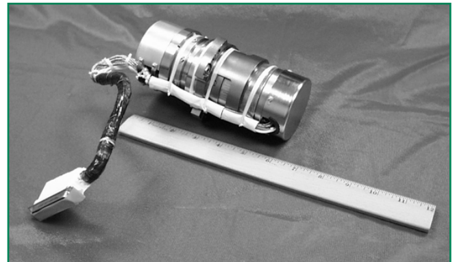
Rate Sensor Assembly

of 19,200 rpm on gas bearings. This wheel is mounted in a sealed cylinder, which floats in a thick fluid. Electricity is carried to the motor by thin wires (approximately the size of a human hair) which are immersed in the fluid. Electronics within the gyro detect very small movements of the axis of the wheel and communicate this infor-