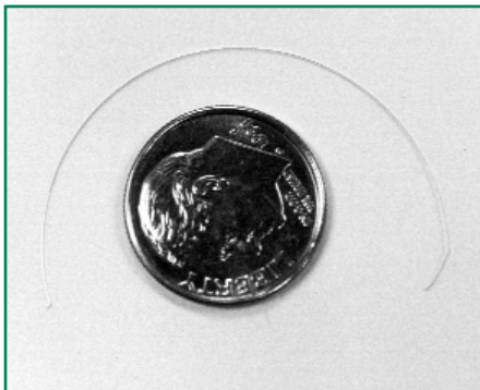
Tiny Wires Inside Gyroscope Assembly

Three of the Hubble's six gyros are not working, leaving only the minimum number needed to continue its science program. At present the Telescope continues to operate normally with no impact to its mission. However, should another gyro go offline, Hubble will automatically place itself into a protective safe mode. In this mode,